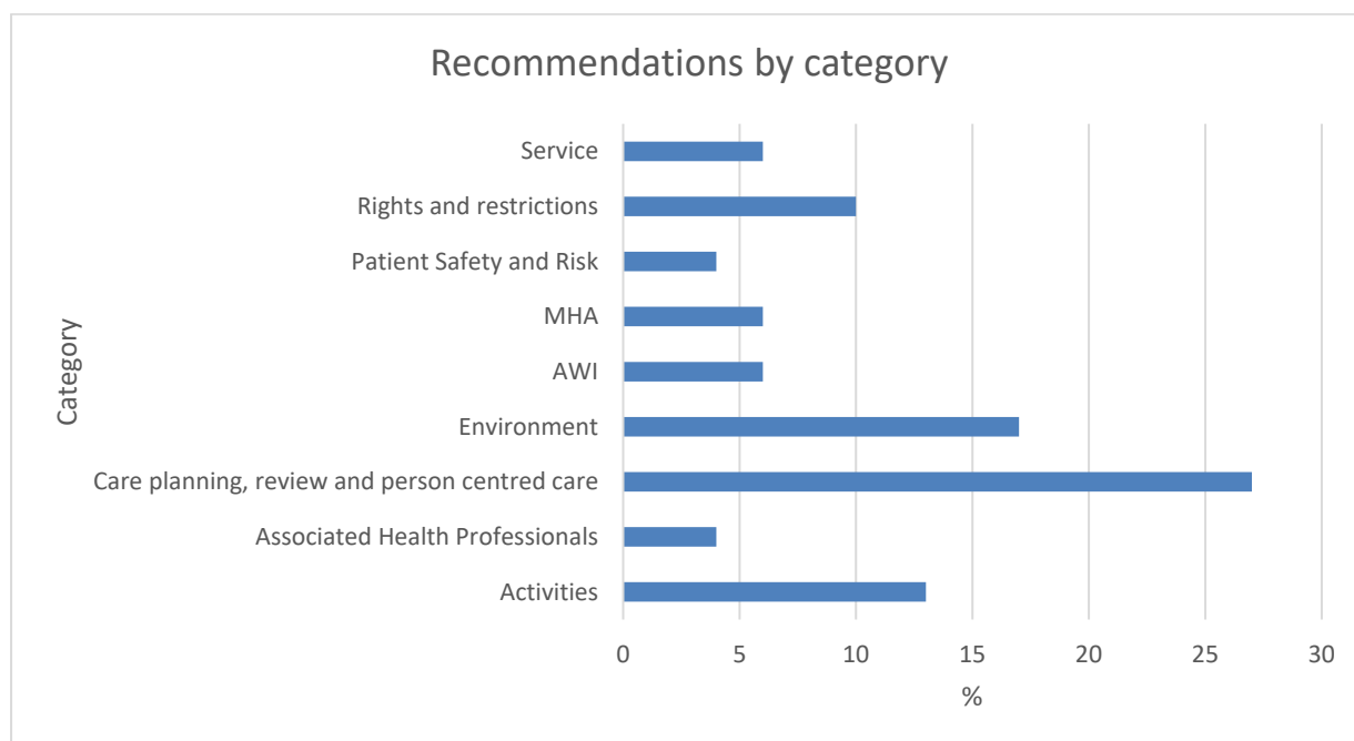
Chart 2: Percentages of recommendations by type (1 January 2017 – 31 December 2017)

The distribution of recommendation category across all recommendations is broadly similar to last year.